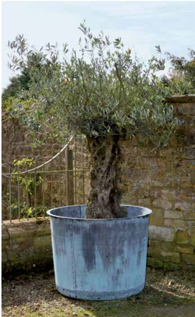
The Very Large Circular Copper Planter Hand crafted from heavy gauge copper, riveted together and then verdigris patinated to imitate the Victorian antique originals. Height 2' 5" [73.5 cm] Diameter 3' 3/4" [101 cm]