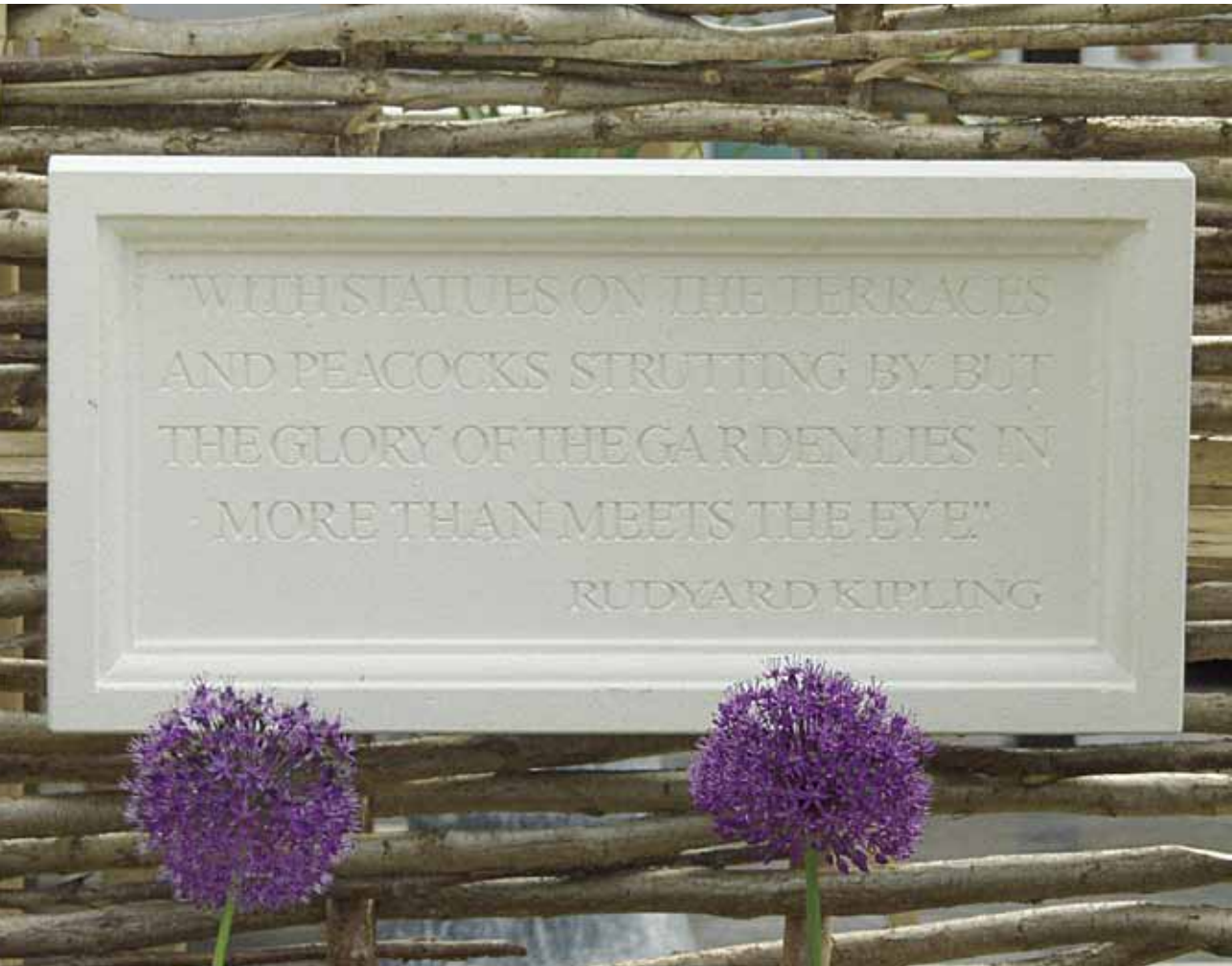
An Example of our Letter Cutting Service