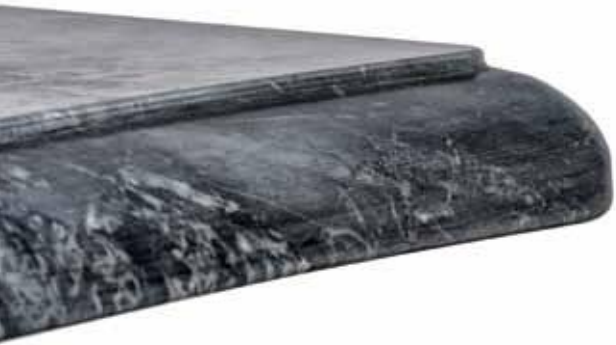
The Florentine Marble Table