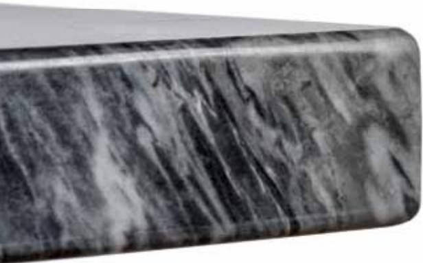
The Milanese Marble Table