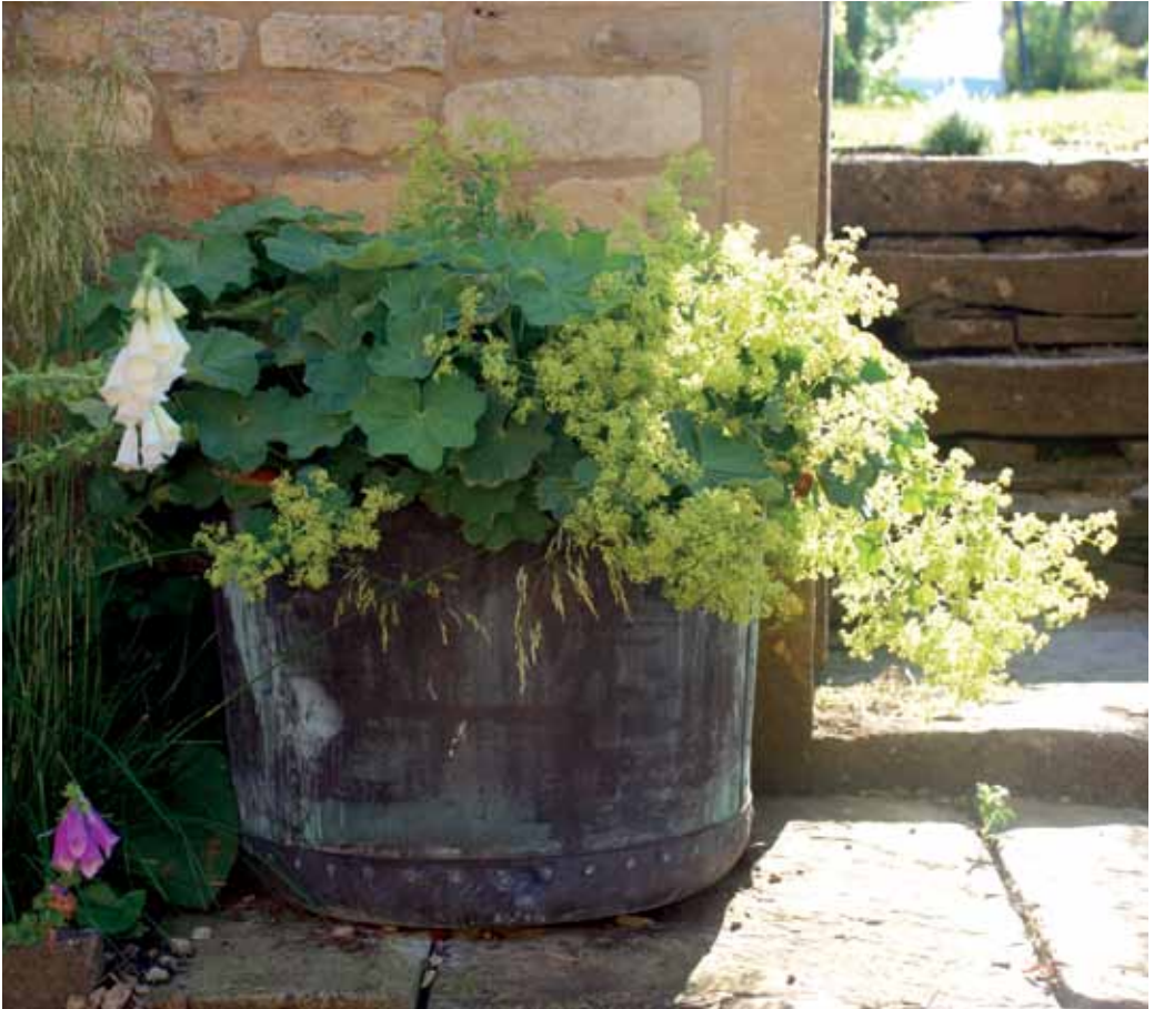
The Medium Circular Copper Planter Hand crafted from heavy gauge copper, riveted together and then verdigris patinated to imitate the Victorian antique originals. Height 1' 5 3 / 4 " [45 cm] Diameter 2' 3" [6 .5 cm]