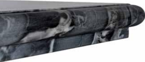
The Venetian Marble Table