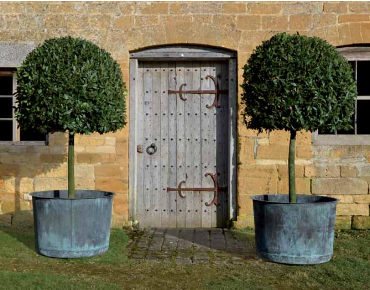
A Pair of Large Circular Copper Planters