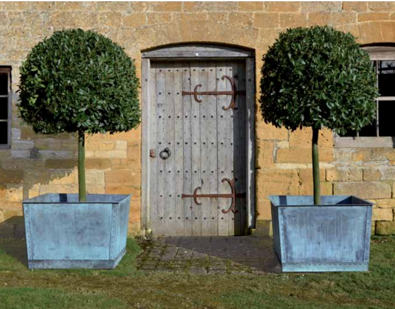
A Pair of Large Square Copper Planters