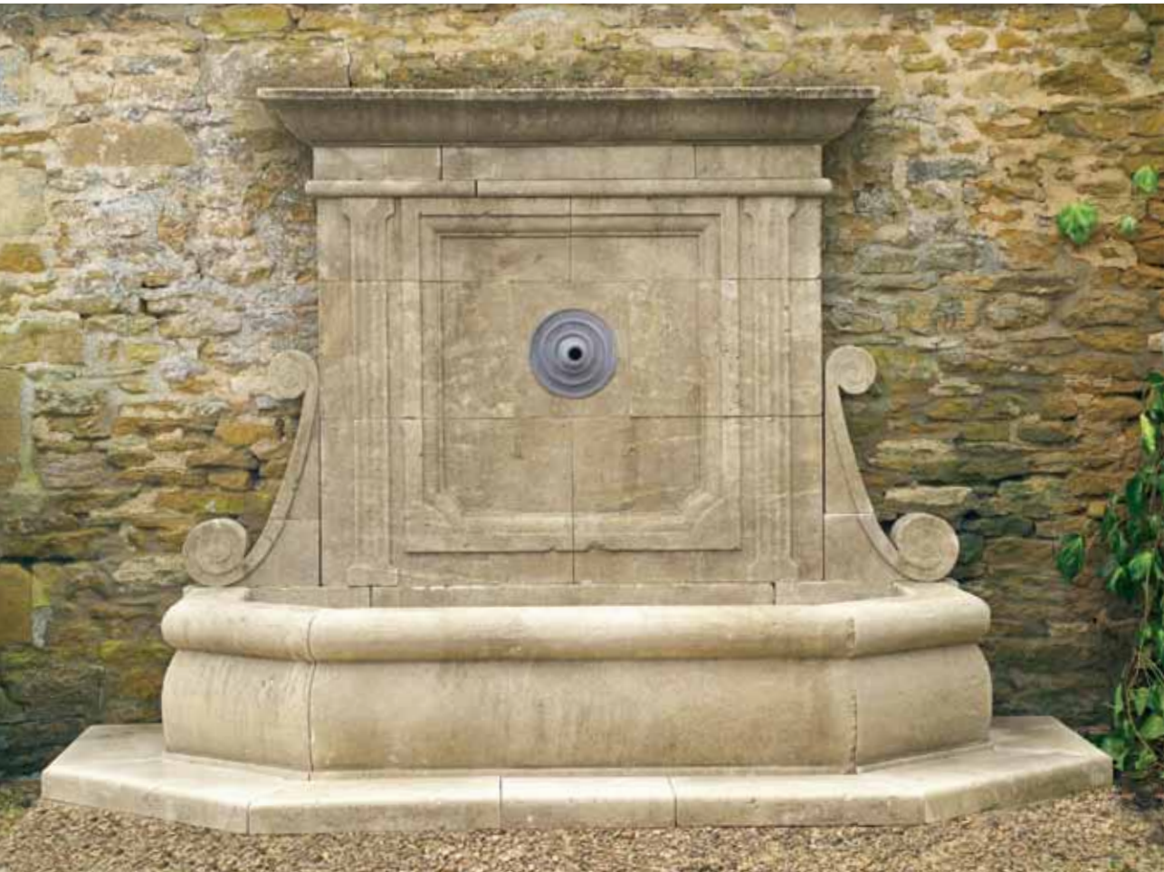
The Neptune Wall Fountain with Lead Spout A large hand carved natural limestone wall fountain with lead spout. Overall height 6' 5" [196 cm] Overall width 9' " [295 cm] Overall depth 4' 6" [137 cm]