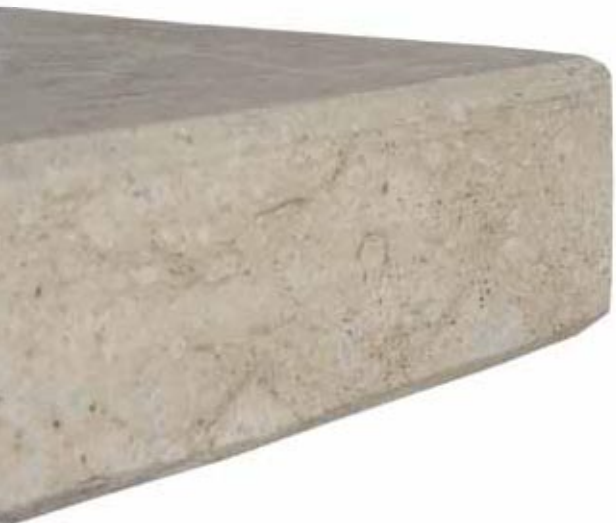
The Paduan Stone Table