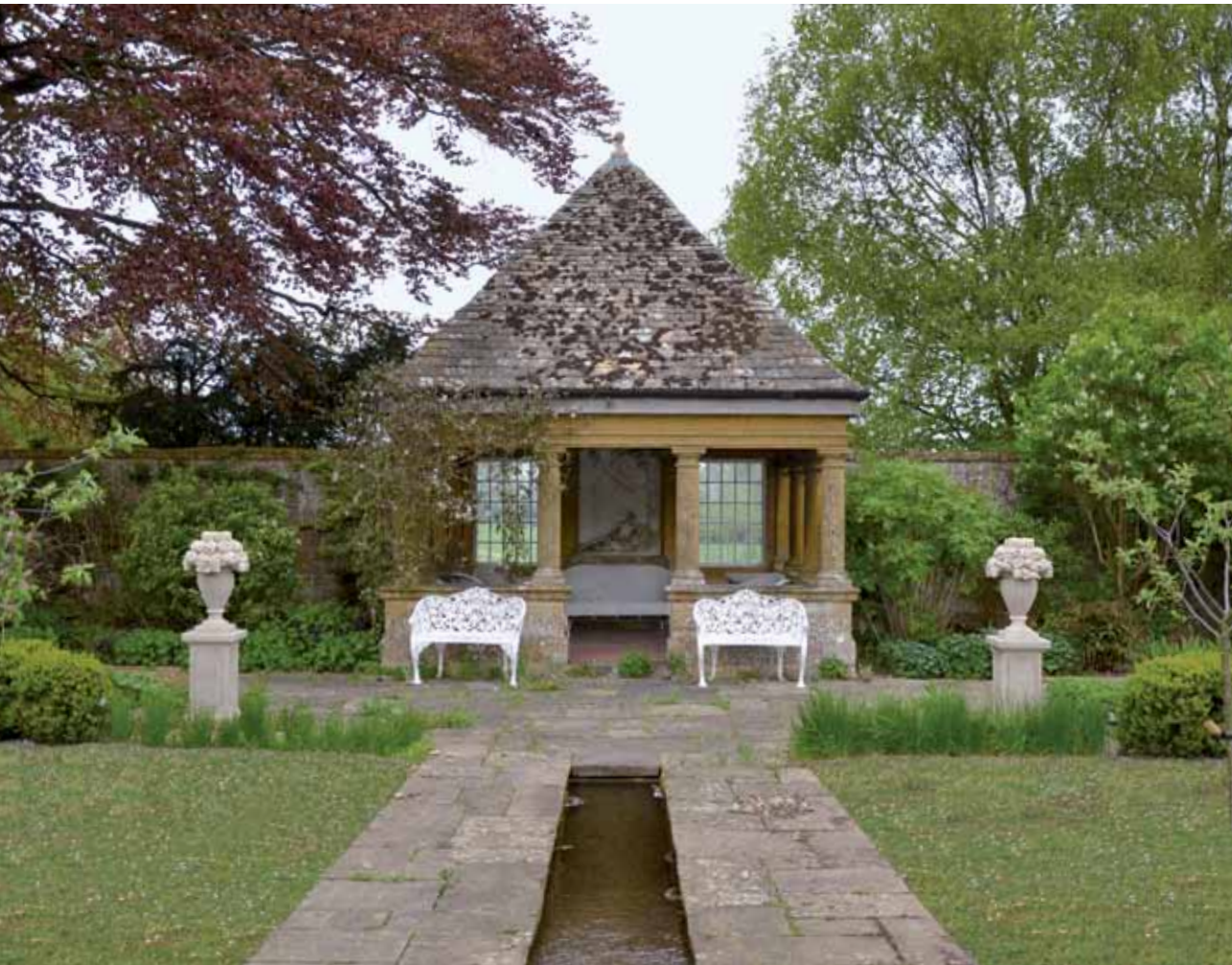
A Pair of Fruit Baskets in a Gloucestershire Garden