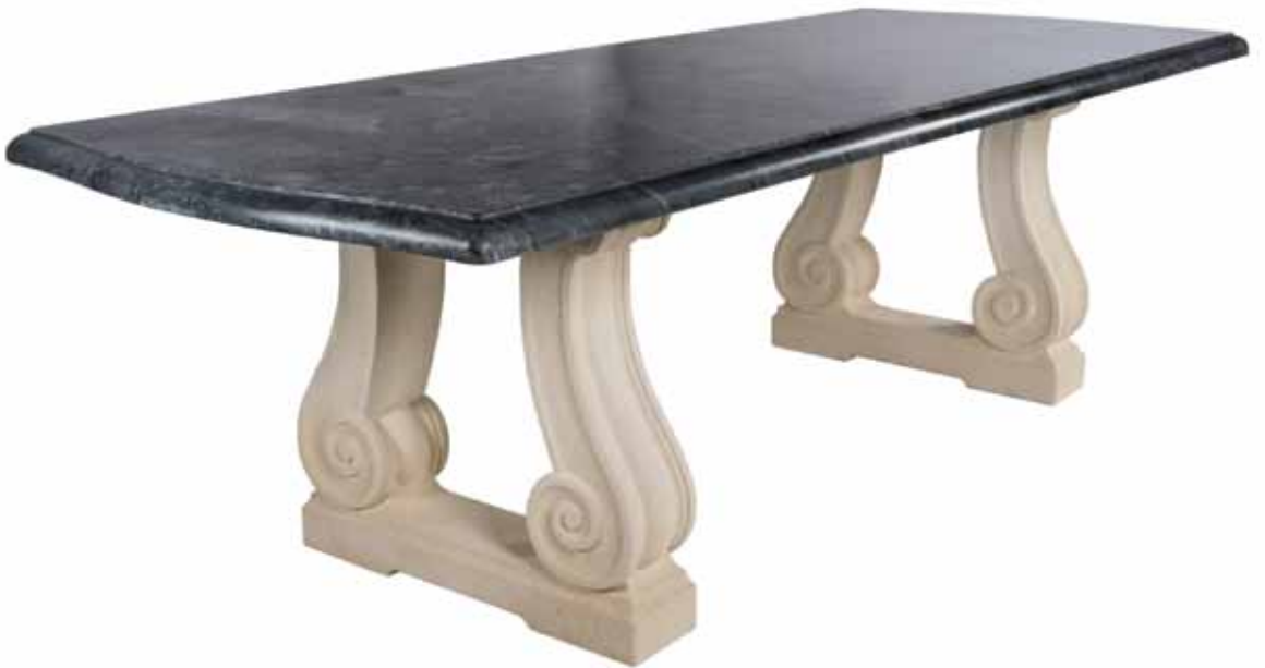
The Florentine Marble Table Shown here with alternative leg design.