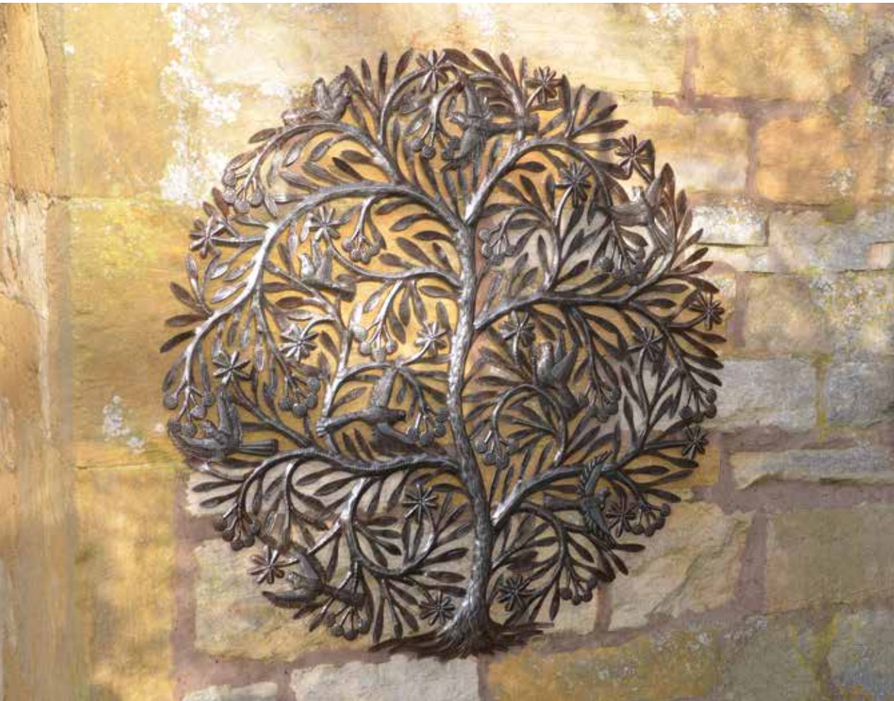
The Tree of Life Decorative Metal Wall Panel A hand punched and finished decorative panel incorporating a tree with birds of paradise. Diameter 2' 10" [86.5 cm]