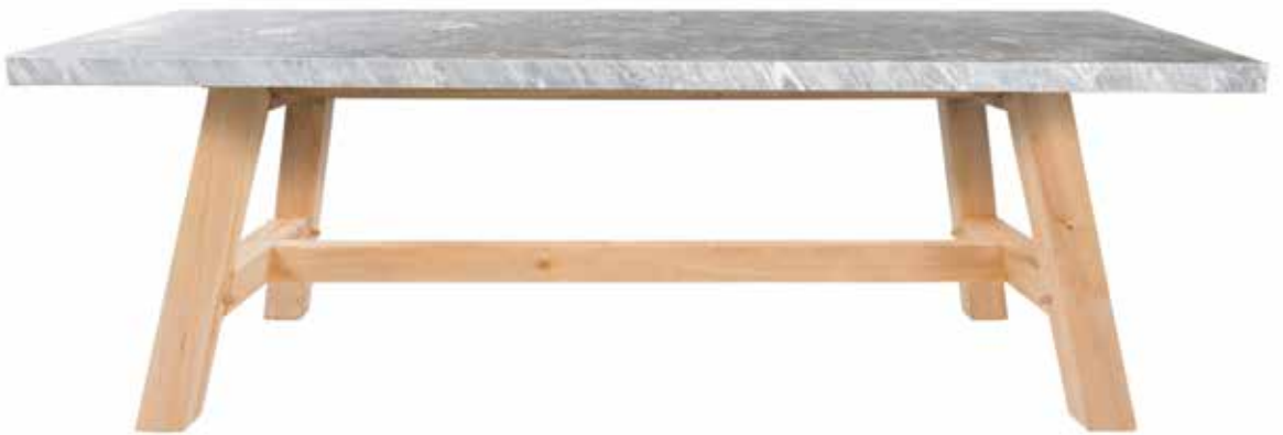
The English Oak Garden Dining Table with Arabesque Marble Top A mortise and tenoned English Oak base supporting a solid Italian Arabesque marble top. Height 2' 4" [71 cm] Length 6' 10 3 / 4 " [210 cm] Depth 2' 11 1 / 2 " [90 cm]