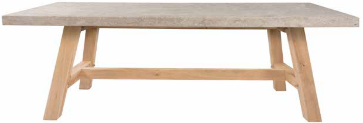
The English Oak Garden Dining Table with Natural Limestone Top A mortise and tenoned English Oak base supporting a solid natural limestone top. Height 2' 4" [71 cm] Length 6' 10 3 / 4 " [210 cm] Depth 2' 11 1 / 2 " [90 cm]